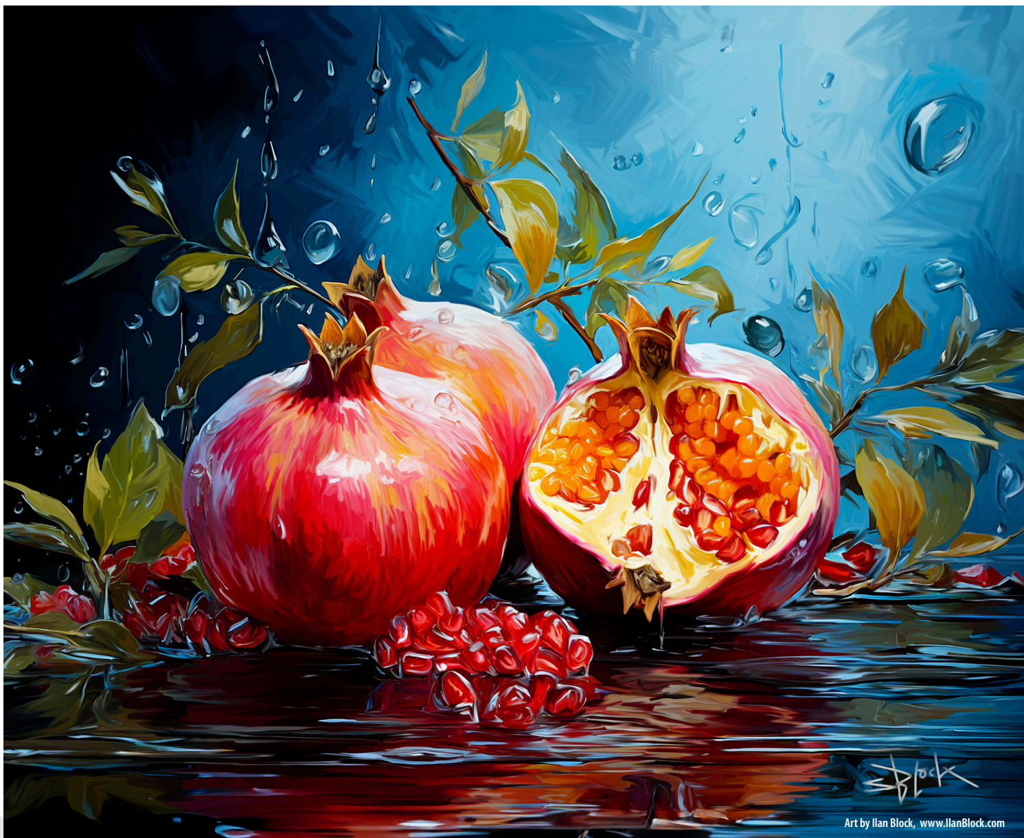
Art by Ilan Block, www.IlanBlock.com